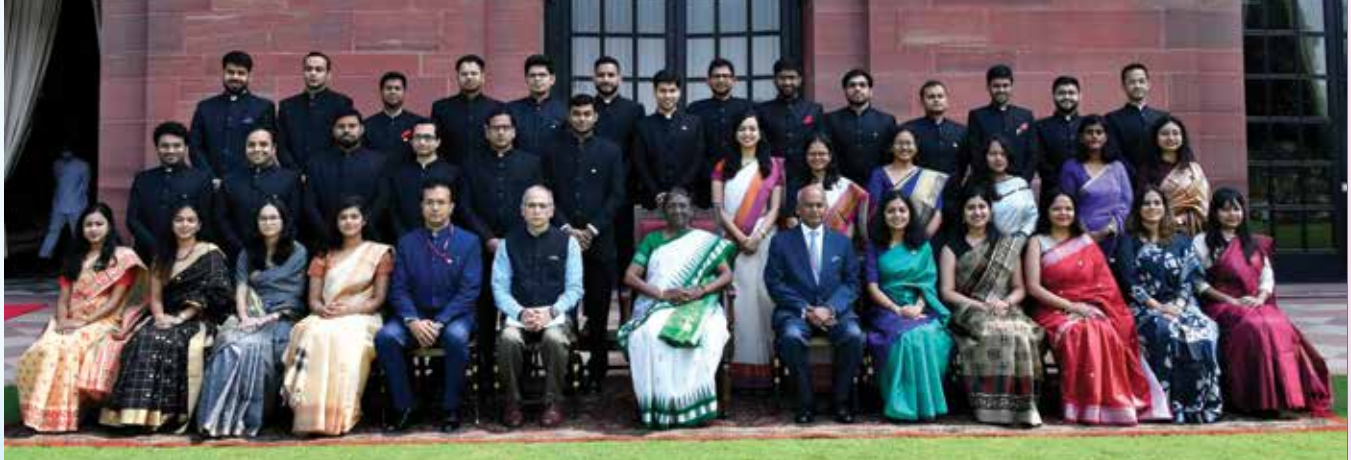
Call on Hon'ble President of India, Smt. Droupadi Murmu